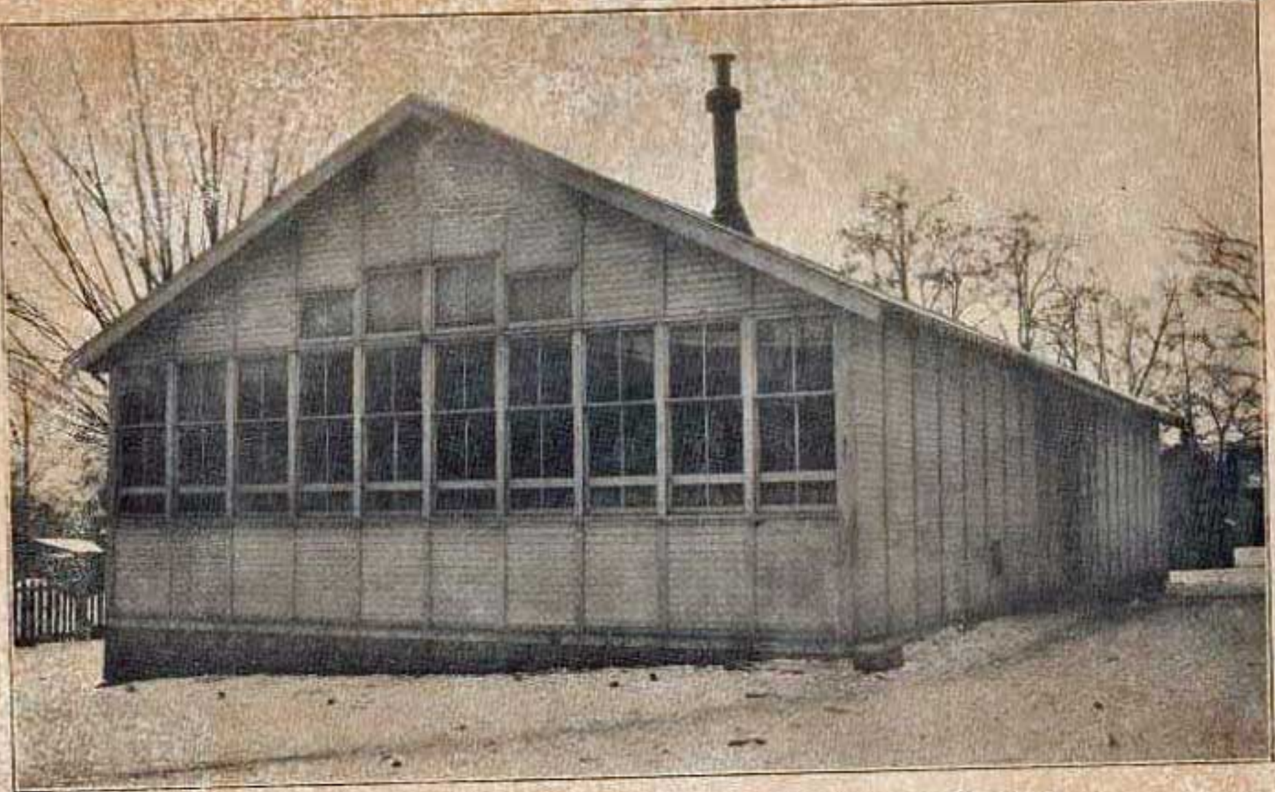
There is no effort to satisfy the appeal for beauty in the portable school building. It is a matter of direct utility with the added feature of saving the money of the taxpayer. The astonishing low cost is indicated in the fact that $2,908.32 has afforded class accommodations for children numbering between eighty and one hundred.