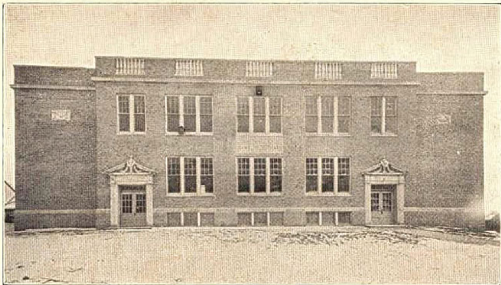
This general view of the G. A. R. Memorial, Building Number Two, emphasizes the ideals which the school government has in mind. Present demands are supplied, but the importance of building with an eye to the future is indicated in the outline which provides easily for such additions as may become necessary.